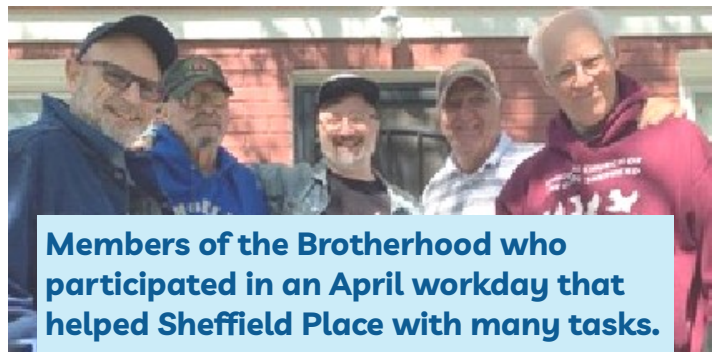
Members of the Brotherhood who participated in an April workday that helped Sheffield Place with many tasks.

The Brotherhood of Saint Andrew is making this our outreach effort. We are going to provide food for a Sunday night dinner July 19 th at Sheffield Place. We also want to collect personal items for them as well and we will have a barrel set up near the foyer for that purpose. We will collect toothpaste, hair conditioner, and paper towels this month.