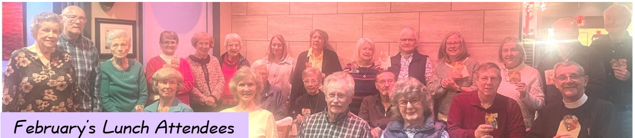
February's Lunch Attendees

We must give the restaurant an accurate headcount.